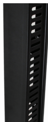
Cable Duct 800mm