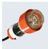
20A Captive Round Pin