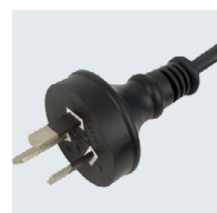
10A Standard Mains