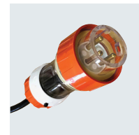
20A Captive Round Pin