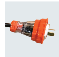
20A Captive Flat Pin