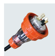
10A Captive Flat Pin