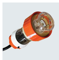
20A Captive Round Pin