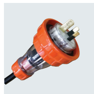
10A Captive Flat Pin