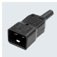
15A IEC (C20)