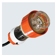
20A Captive Round Pin