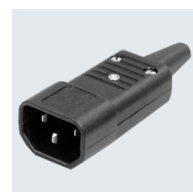
10A IEC (C14)