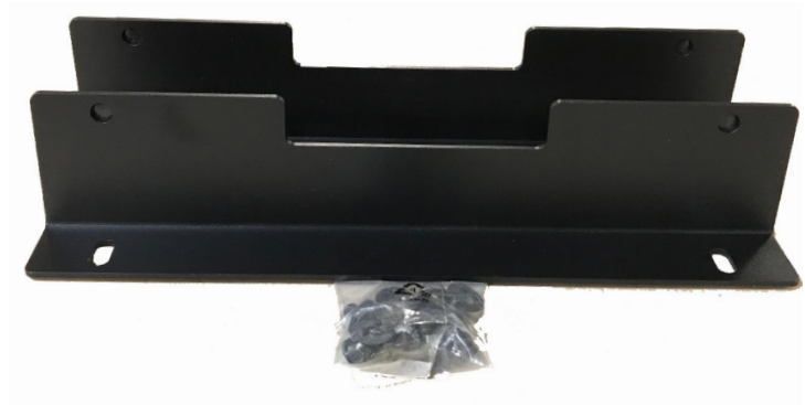
Rack Bolt Down Kit for iQS Cabinet – Set of 2