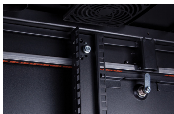
Adjustable Mounting Rail