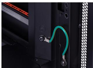
Integrated Electrical Grounding