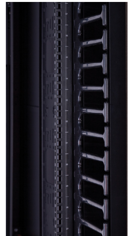
Optional Vertical Cable Managers