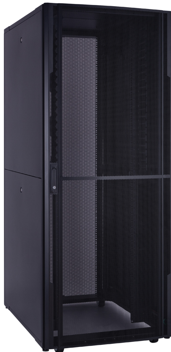
Typical iQ Series Cabinet