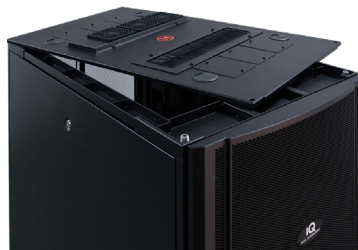
Optional Brushed Cable Entry