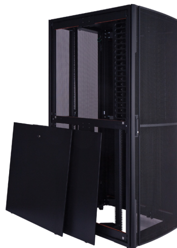
Split Side Panels