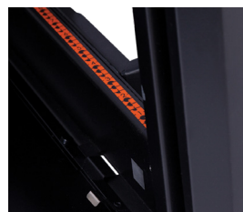
Rail Alignment Feature