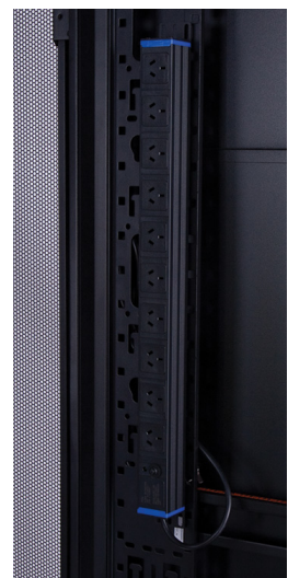
Optional PDU Tray