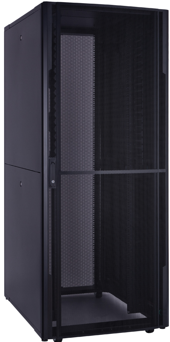
Typical iQ Series Cabinet