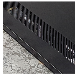
Side panel with ventilation for airflow