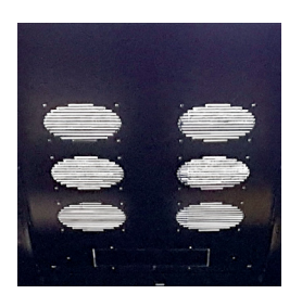
Top Panel showing fan grills and knockout