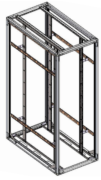
800w x 1200d Frame Assembly