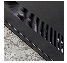
Side panel with ventilation for airflow