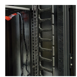
Vertical power rails and cable managers available