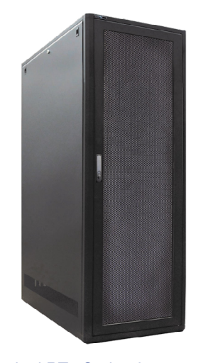
Typical RT2 Series frame with optional door and side panel