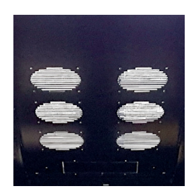
Top Panel showing fan grills and knockout