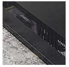
Side panel with ventilation for airflow