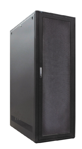
Typical RT2 Series frame with optional door and side panel