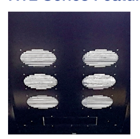
Top Panel showing fan grills and knockout