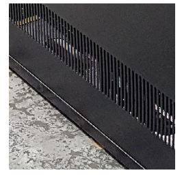
Side panel with ventilation for airflow