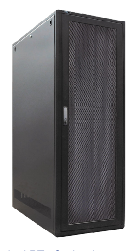
Typical RT2 Series frame with optional door and side panel