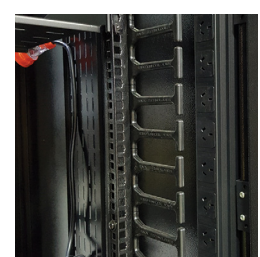
Vertical power rails and cable managers available