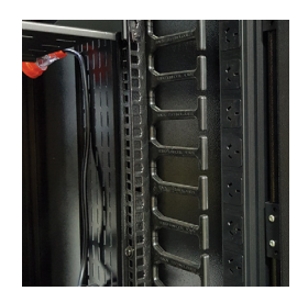
Vertical power rails and cable managers available