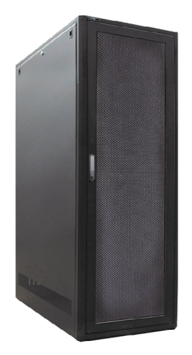
Typical RT2 Series frame with optional door and side panel