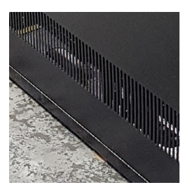
Side panel with ventilation for airflow