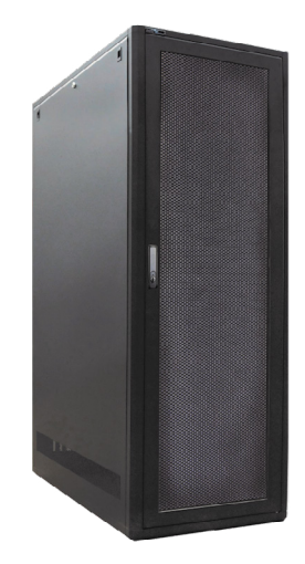
Typical RT2 Series frame with optional door and side panel