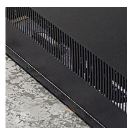
Side panel with ventilation for airflow