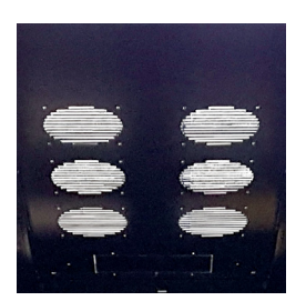
Top Panel showing fan grills and knockout