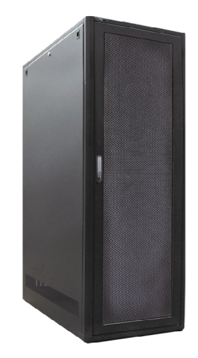
Typical RT2 Series frame with optional door and side panel