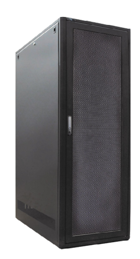
Typical RT2 Series frame with optional door and side panel