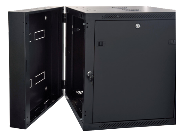
Removable 100mm deep rear section hinged with 19" mounting facility.