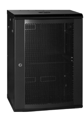
Vented Door - WRH6424V