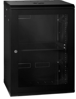
Acrylic Door - WRH6424 (Standard)