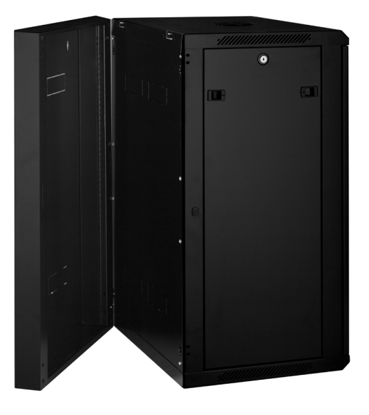
Removable 100mm deep rear section hinged with 19" mounting facility.