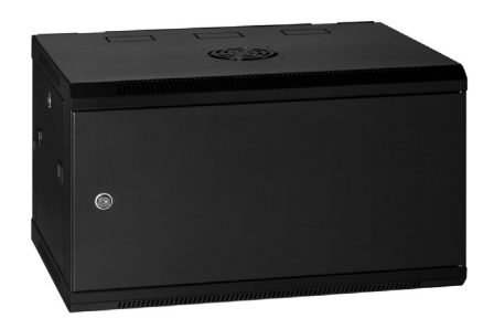
Steel Door - WRH6406S