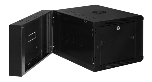
Removable 100mm deep rear section hinged with 19" mounting facility.