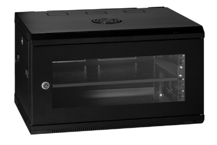
Acrylic Door - WRH6406 (Standard)