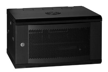
Vented Door - WRH6406V