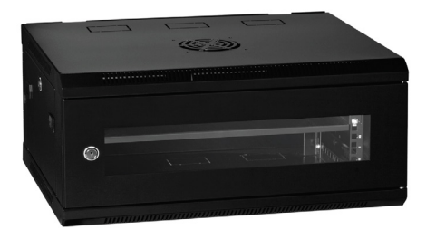
Acrylic Door - WRH6404 (Standard)