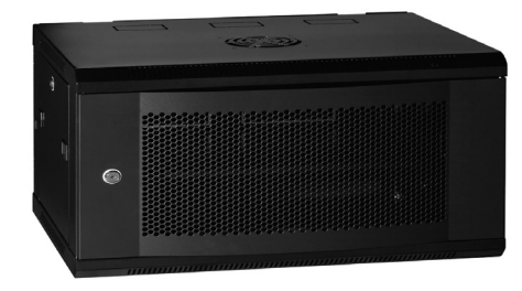
Vented Door - WRH6404V