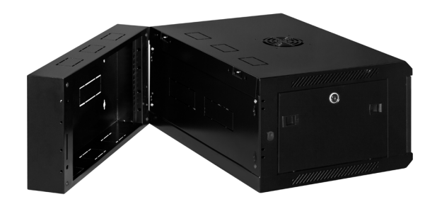
Removable 100mm deep rear section hinged with 19" mounting facility.