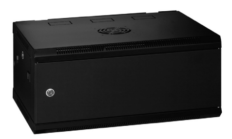
Steel Door - WRH6404S