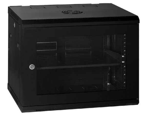
Acrylic Door - WR6609 (Standard)