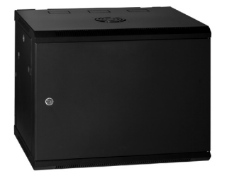
Steel Door - WR6609S