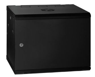
Steel Door - WR6409S