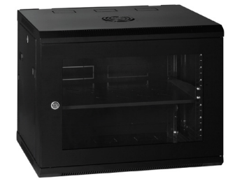
Acrylic Door - WR6409 (Standard)