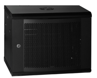
Vented Door - WR6409V