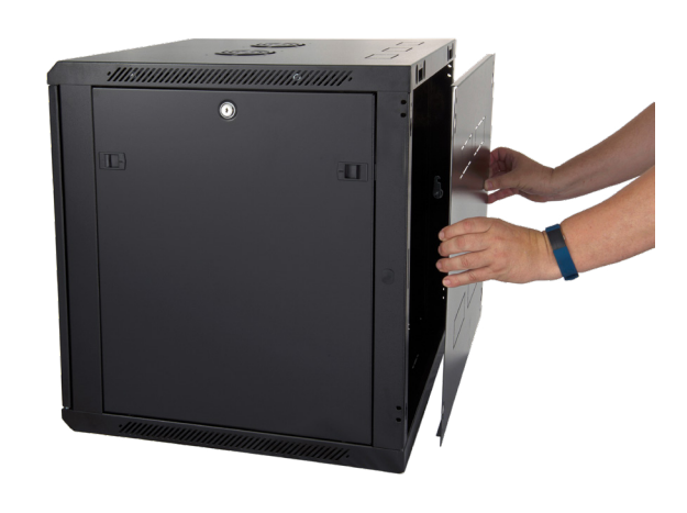
Removable rear panel