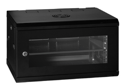
Acrylic Door - WR6406 (Standard)