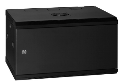
Steel Door - WR6406S