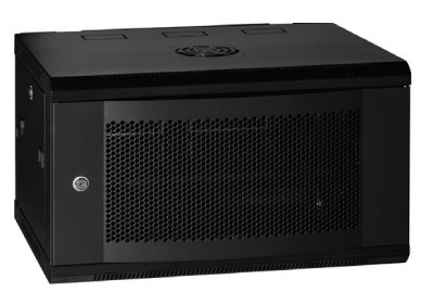
Vented Door - WR6406V