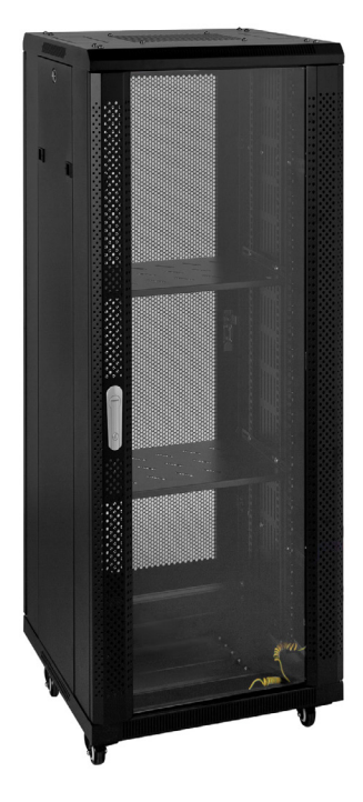
Glass Door - RTX6027G