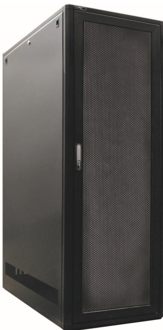
Complete Cabinet Assembly

A fully customisable design which allows for hundreds of variations in size and panel configuration.