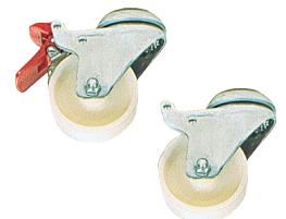
CASTORS (SET OF 4)

*BI-FOLD DOOR - Style YY = width (mm) and type. 11 = 600 wide - acrylic | 21 = 600 wide - steel | 23 = 600 wide - perforated